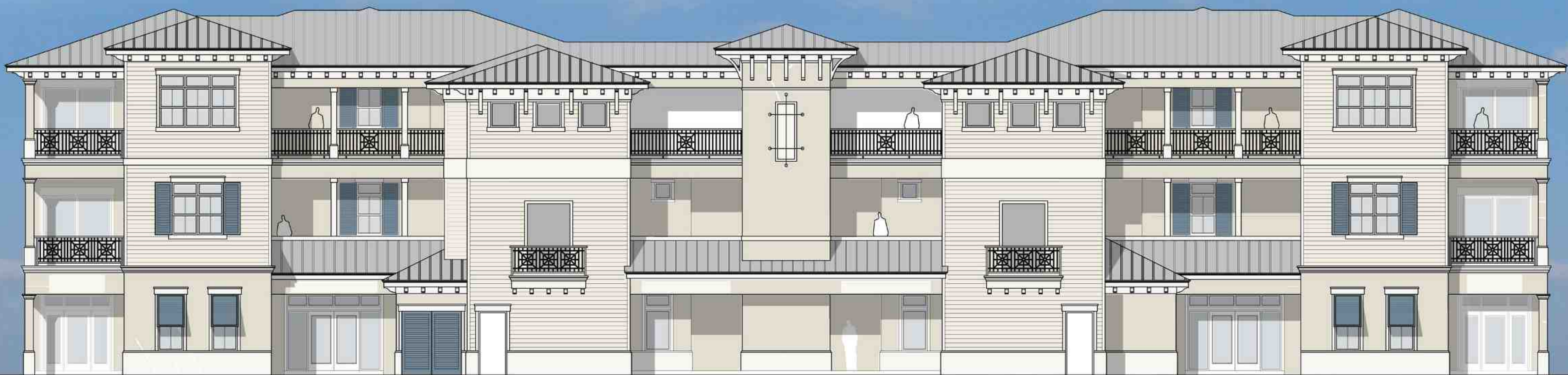
BUILDING A REAR ELEVATION (EAST)

SCALE : 1/8" = 1'-0" FACING US HIGHWAY ONE