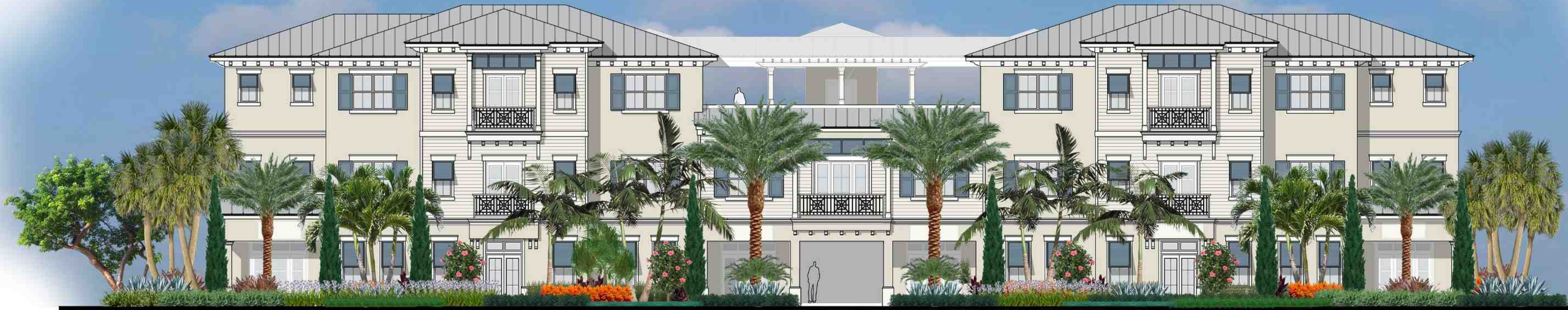
BUILDING A FRONT ELEVATION (WEST)

SCALE : 1/8" = 1'-0" FACING US HIGHWAY ONE