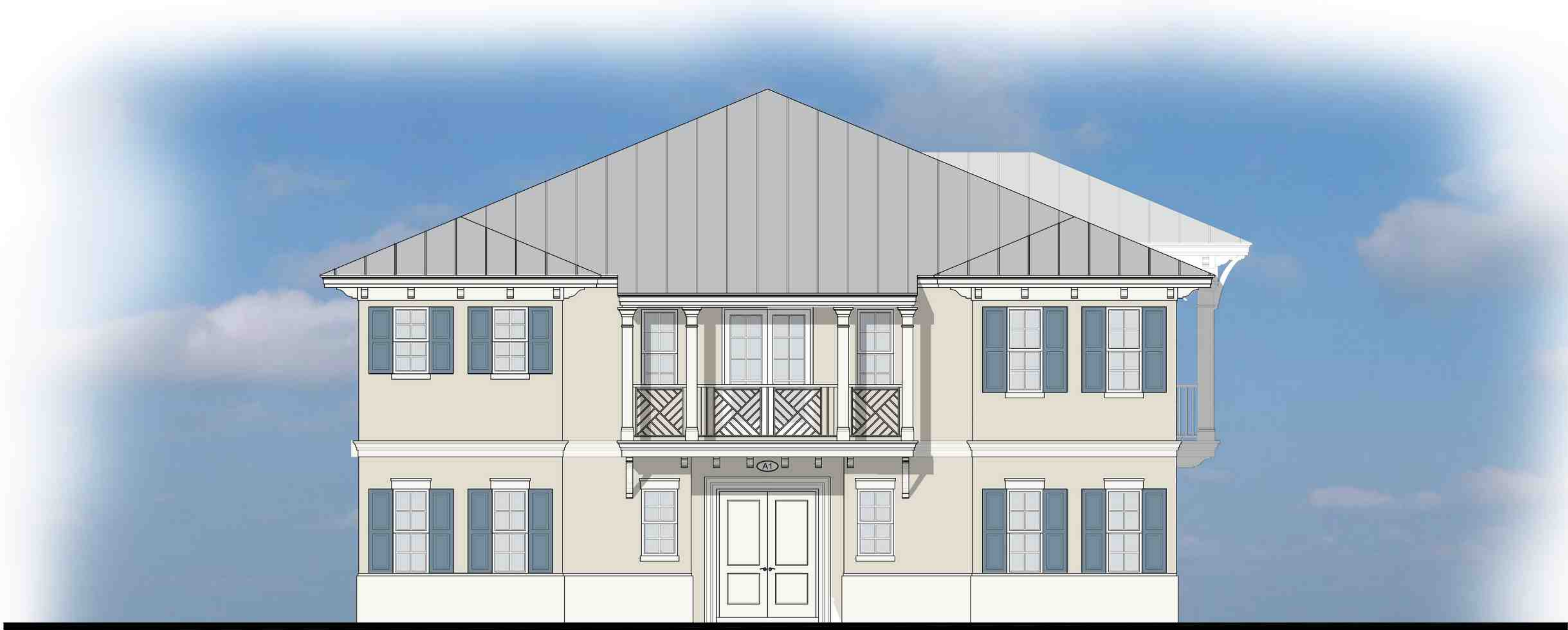
BUILDING B TOWN HOUSE SIDE ELEVATION (NORTH)

SCALE : 1/4" = 1'-0" FACING US HIGHWAY ONE