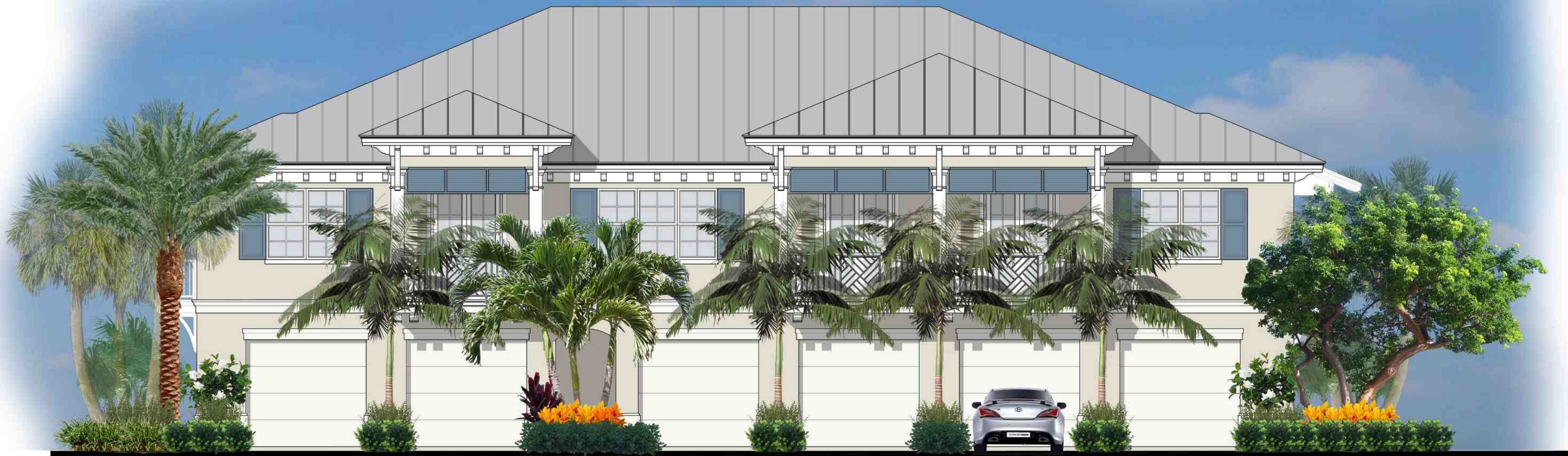
BUILDING B TOWN HOUSE FRONT ELEVATION (WEST)